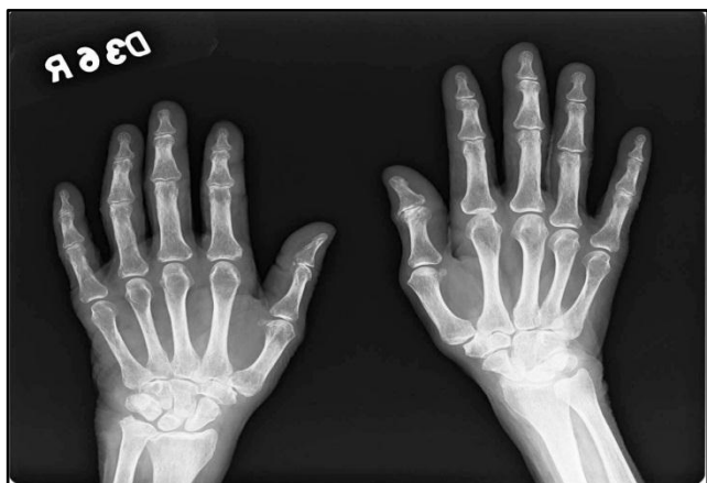
Figure-2: X ray bilateral hand and wrist show no bony erosion