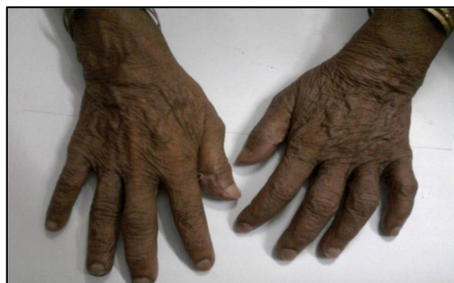
Figure-4: Diffuse edema & swelling completely subsided.

X ray bilateral hand and wrist showed no bony erosion and bilateral sacroiliac joint were normal [figure 2 & 3]. On the basis of above findings, we put the diagnosis of Remitting Seronegative Symmetrical Synovitis with pitting edema. we started Low dose steroids (15 mg/day) along with calcium, Patient was dramatically improved after One Week Of Therapy [figure 4]. Patient discharged on low dose steroid as maintenance dose. On follow-up, Patient was in complete remission for the last two months without any symptoms on low dose steroids.