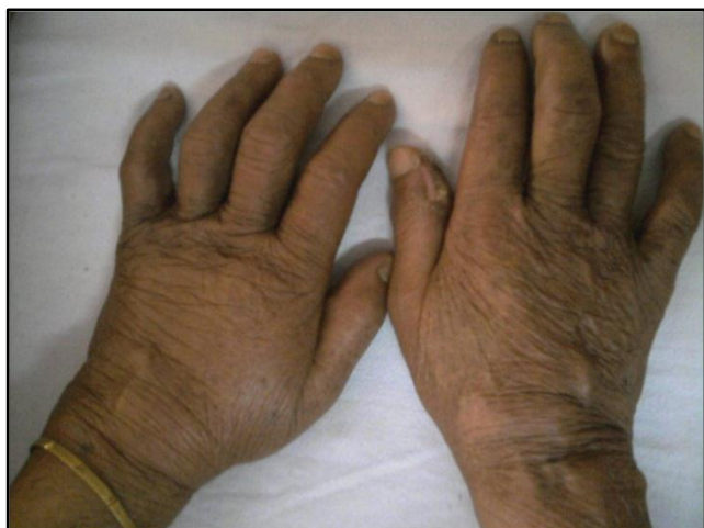
Figure-1: Multiple nodular tender swelling present over the wrist & back of the hand. These swellings are mobile in transverse direction but not in longitudinal when the tendons are taut.

Suggestive of tenosynovitis involving extensor and flexor tendons of bilateral wrist.